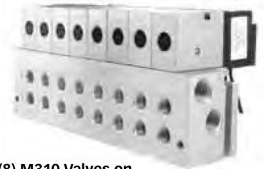
(8) M310 Valves on SM8 Manifold