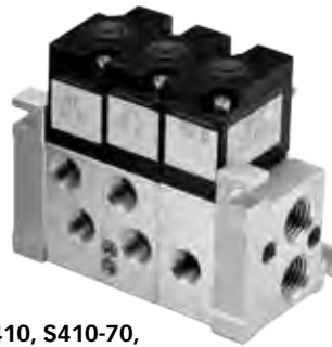
S410, S410-70, and S310 Stackable Assembly