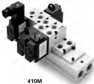
410M Accepts 310 and/or 410 Series Inline Valves (410M6 shown)