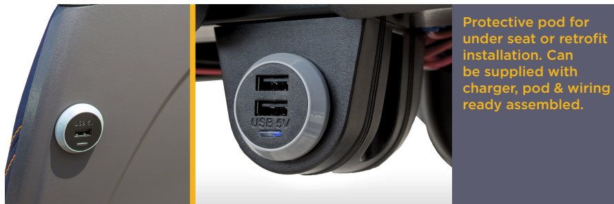
Protective pod for under seat or retrofit installation. Can be supplied with charger, pod & wiring ready assembled.

All versions in the range can be connected directly to both 12Vdc and 24Vdc systems without adjustment. The advanced electronic design will detect the charge status of the device and alter the charging process accordingly. This ensures that whatever device is connected, be it Apple, Android, iPad, phone or tablet, it will always be charged as fully as time and capacity allow.