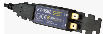
PV-USB2: Charger only, no interface. For under-dash use.