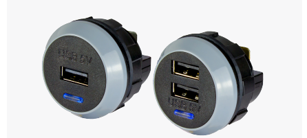
PowerVerter USB PVPro-S and PVPro-D single and double outputs