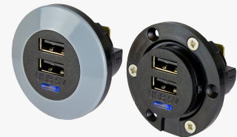
PVPro-DFf, front fitting version can be screwed in place from the front, then covered with attractive ring to avoid tampering.